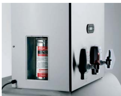
Filter compartment at side.

Large Capacity Instant Boiling and Chilled Filtered Water System 5.0/3.2 Litre, 16.5/3.2 Litre Electronically Controlled Models