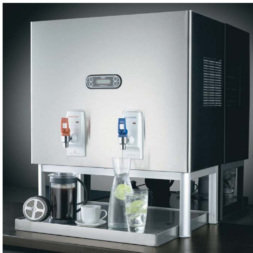
Zip Duo on stand with drip tray offering both boiling and chilled filtered water.