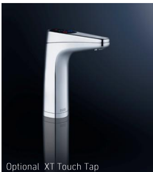
Optional XT Touch Tap