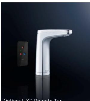
Optional XR Remote Tap