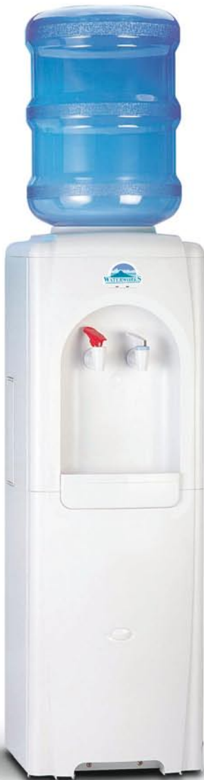
B10CH Hot & Cold (pictured) B10C Cool and Cold (also available)