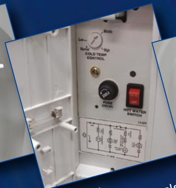
Concealed (yet accessible) controls