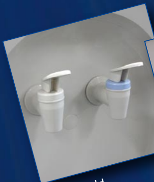
Cool & Cold (B10C) also available