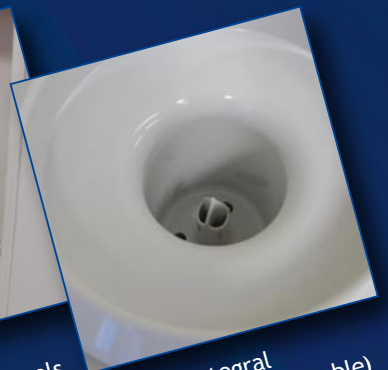
Includes integral no-spill spike (removable)